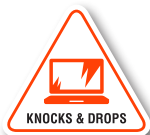
KNOCKS & DROPS

Resulting in cracked screens, broken buttons.