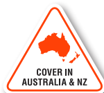
COVER IN AUSTRALIA & NZ

To get your device working again or organise a replacement.