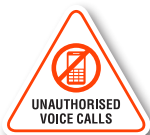
UNAUTHORISED VOICE CALLS

For example, if you have left your device in a cab or at the airport.